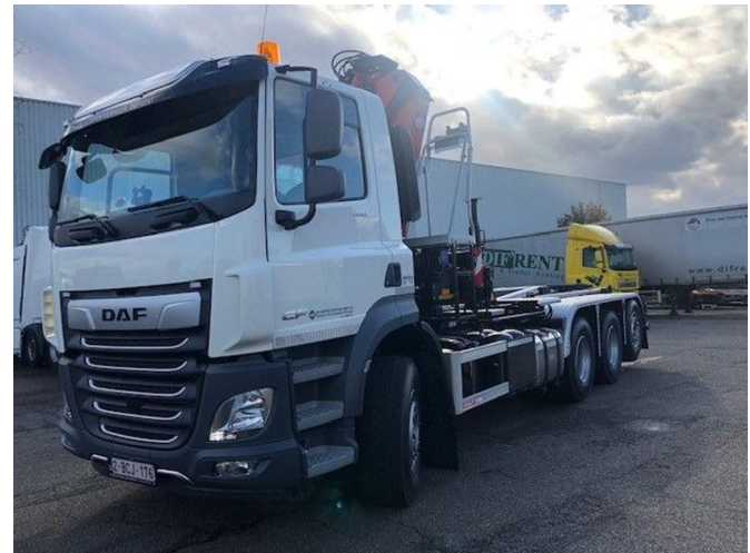
DAF CF 480 FAW 8x4 +container hook WAF 22T + crane H...

Referentienummer: DIFCHWKR14 - 2BCJ176 - 0G362045