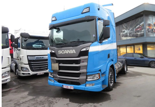
Scania R 410 LNG ADR RETARDER