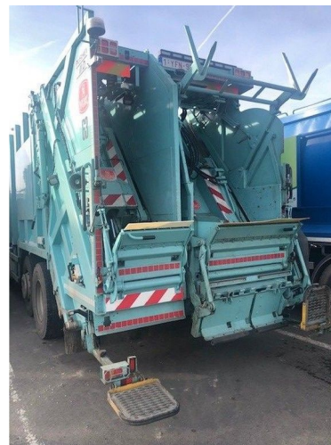
DAF CF 330 FAG as-tronic 6*2 + VDK PUSHER IIK/IID ... 6x2 Referentienummer: HVW-1166 - 1YFN958 - 0G052654